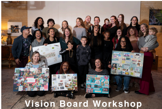
Vision Board Workshop