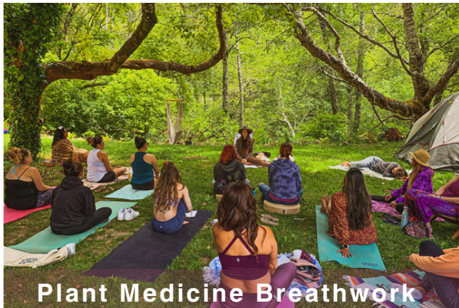
Plant Medicine Breathwork