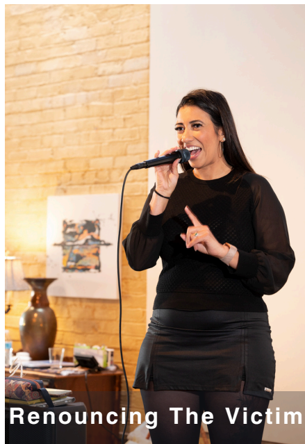
Renouncing The Victim