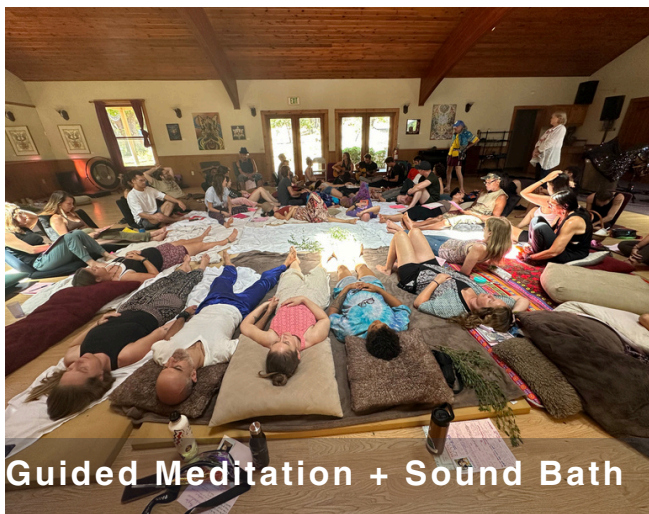
Guided Meditation + Sound Bath